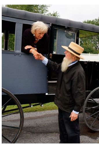
Peace on Earth from Budapest to Pennsylvania!