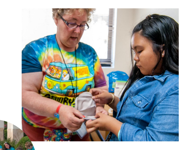
Youth Rally activities include: educational sessions, physical activities, field trips, motivational speakers, a fashion and talent show and lots more.

Be "Bould" and sign up today at youthrally.org/applications.