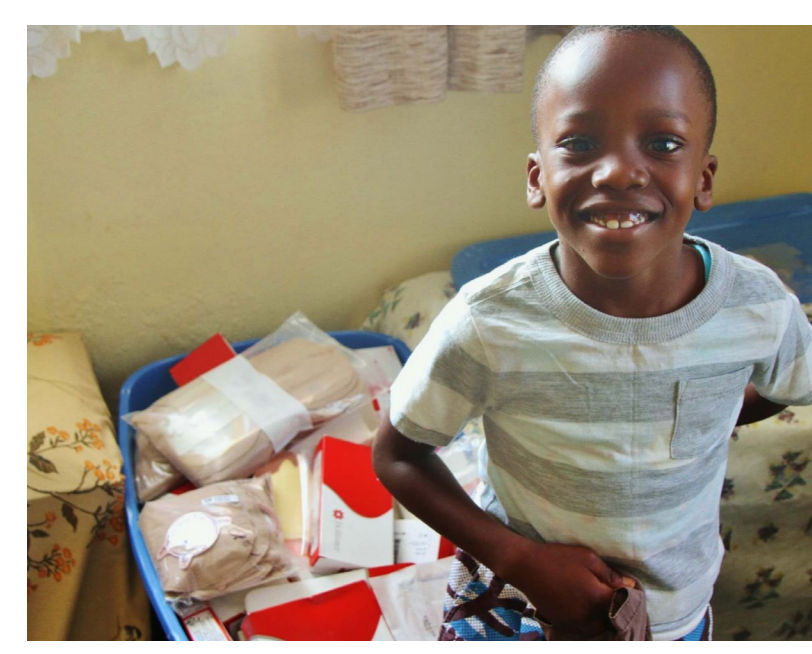
A happy patient in Uganda