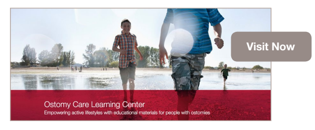
Ostomy Care Learning Center