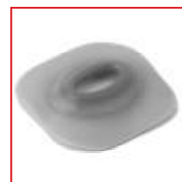
Adapt Convex Barrier Ring stretched to oval shape and placed on a skin barrier.