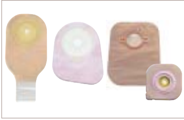
Left to right: One-Piece Drainable Pouch, One-Piece Closed Pouch, Two-Piece Closed Pouch and Skin Barrier.

You can choose the kind of Hollister colostomy pouch you want to use. Your pouch may be part of a one-piece or two-piece pouching system, and many have clear and beige options. You can also select pouches that have a soft cover, such as the Hollister ComfortWear panel, to increase your comfort.