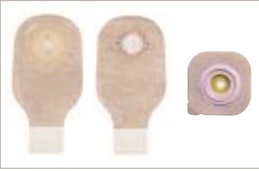
Left to right: One-Piece Drainable Pouch, Two-Piece Drainable Pouch and Skin Barrier.