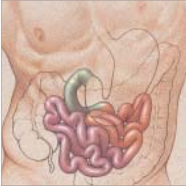
The small intestine.