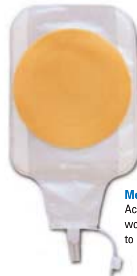
Medium Accommodates wounds up to 9.5cm