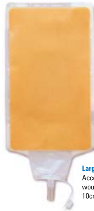
Large Accommodates wounds up to 10cm x 20cm