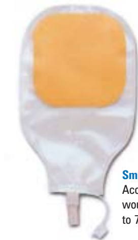
Small Accommodates wounds up to 7.6cm