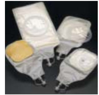
Wound Drainage Collectors

Wound Drainage Collectors designed to effectively collect and contain exudate from draining wounds and fistulae. Made of transparent Odour-Barrier film, each collector features an attached Access Cap for easy inspection and cleaning of the wound; Convenience Drain allows fluids in the collector to be emptied and measured; an attached FlexWear hydrocolloid barrier provides long-wearing skin protection and security to prevent leakage.