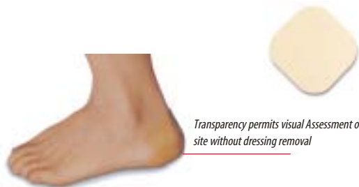
Transparency permits visual Assessment of wound site without dressing removal