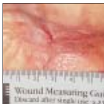
Facilitates moist wound healing