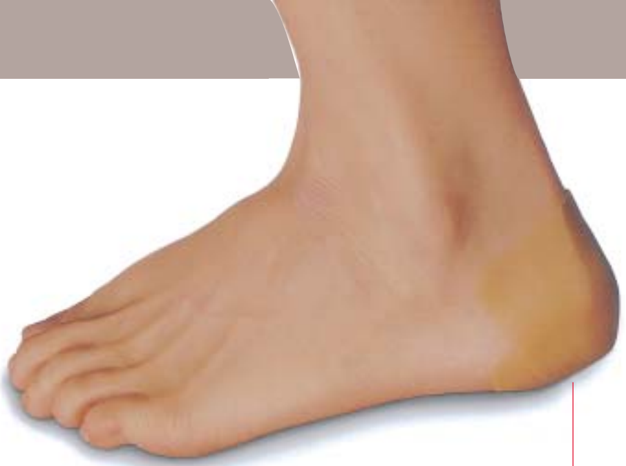
Transparency permits visual Assessment of wound site without dressing removal