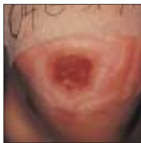
Excellent total fluid handling capacity