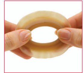
Adapt Convex Barrier Ring being stretched to oval shape.

Hollister and logo, and Adapt are trademarks of Hollister Incorporated. ©2005 Hollister Incorporated. 907392-1005