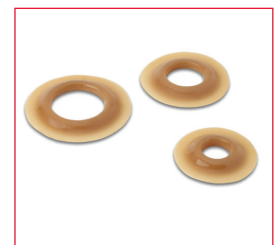
Adapt Convex Barrier Rings Stock No 795xx.