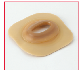
Adapt Convex Barrier Ring stretched to oval shape and placed on a skin barrier.