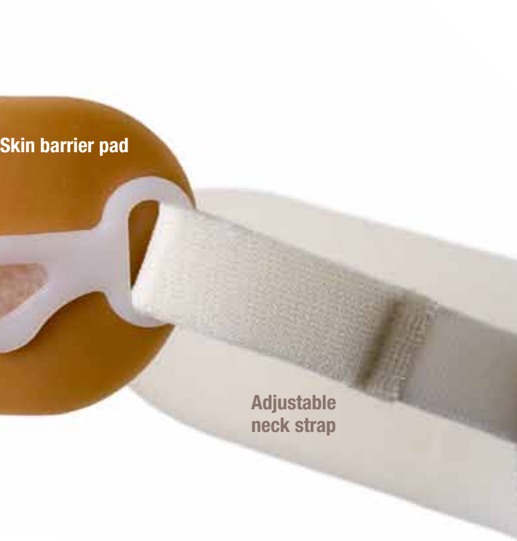
Skin barrier pad

In an independent study, “findings suggest that use of advanced tools, a comprehensive oral care protocol, and staff compliance with the protocol can significantly reduce rates of ventilator-associated pneumonia and associated costs.” 3