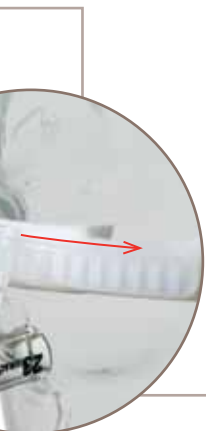
Nonabsorbent upper lip stabilizer