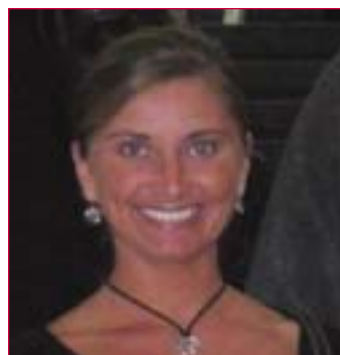
BC, RN, from a large acute rehabilitation center in Kentucky

they have used while in rehabilitation, so they feel confident once they are in the community. They are not waiting for weeks, or even months, to obtain these necessary supplies. Involvement in the Secure Start Program has a positive effect on our patients and staff. The program definitely aids in a smooth discharge to home and transition into the community. And, just as important, the program frees practitioners up from making numerous phone calls to suppliers and insurance companies.