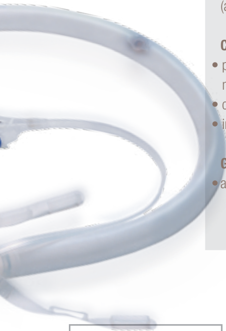
Collapse-Resistant Cylinder and Low-Pressure Cuff