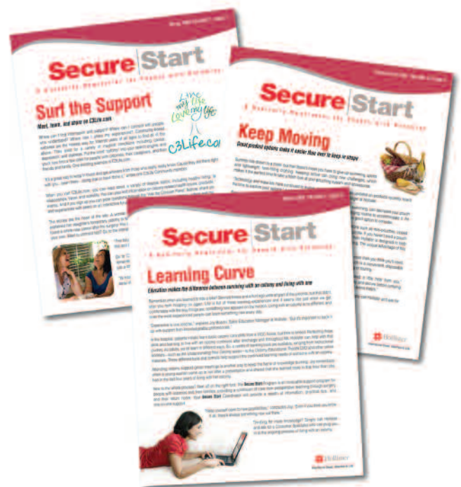
Secure Start Newsletters