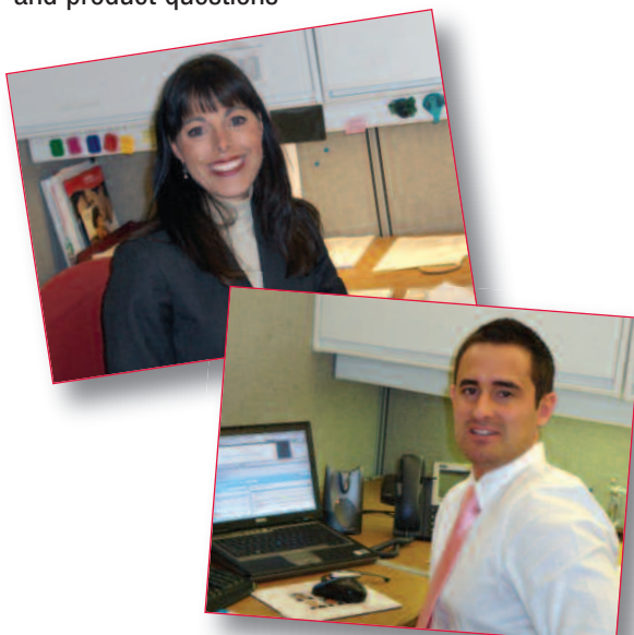
Secure Start Coordinators