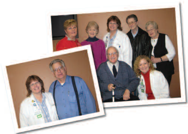
Photographs from April 1, 2009 Outpatient Support Group meeting—Northwest Community Hospital