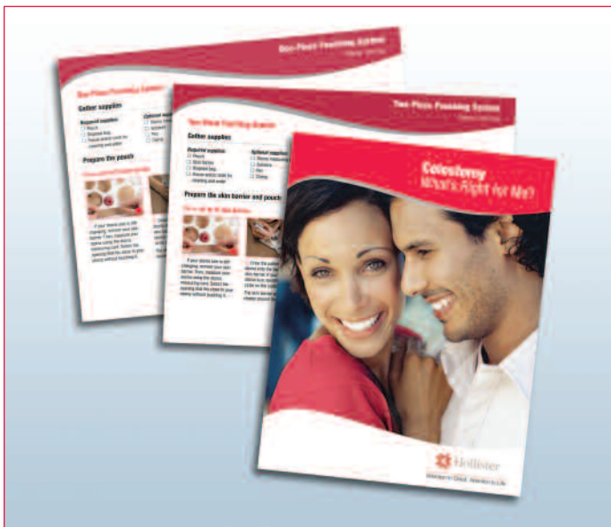
Patient Education Materials

Many new ostomy patients attribute the Secure Start Program with helping their healing begin.