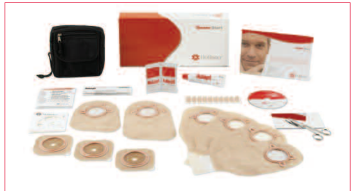
Sample Secure Start Discharge Kit