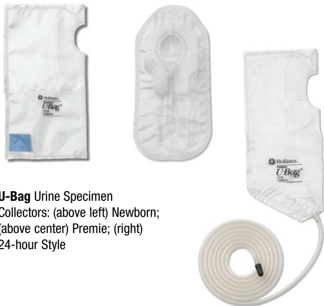
U-Bag Urine Specimen Collectors: (above left) Newborn; (above center) Premie; (right) 24-hour Style