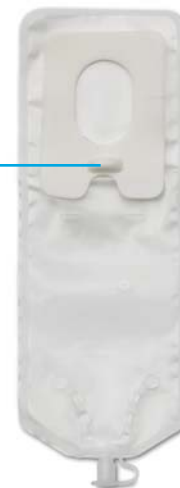
(right) First-Time Urine Specimen Collectors

Patented “bump” simplifies placement on the infant and helps reduce incidence of fecal contamination.