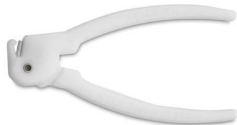
Cord Clamp Clipper