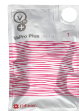
Example: VaPro Plus Pocket catheter*