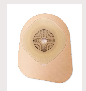
Figure 1 CeraPlus<sup>™</sup> one-piece pouching system with flat cut-to-fit skin barrier.