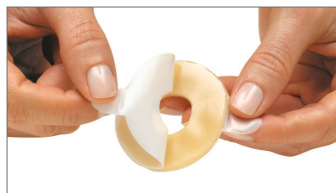
Figure 2 Remove both release liners