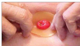
Figure 5 Apply ring to skin, making sure it fits where the skin and stoma meet