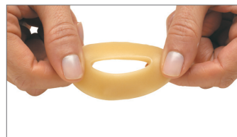
Figure 3 Stretch for an improved fit