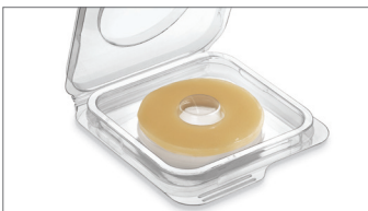
Figure 1 Remove from plastic tray